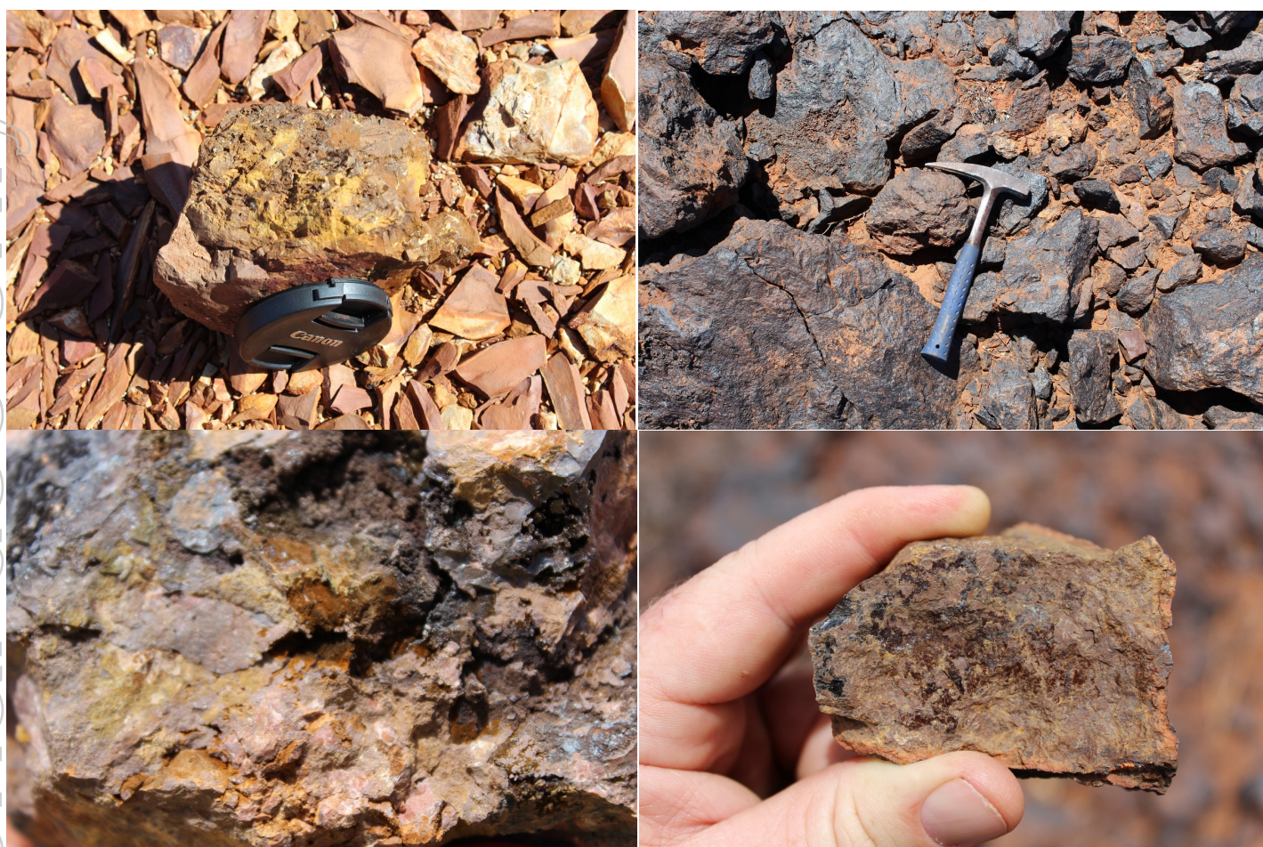
Figure 2 Rock chips from reconnaissance mapping: top right – ferruginous sedimentary breccia; top left - strongly manganiferous, fine grained sediment; Bottom left and right – fine iron oxides, possibly after sulphides, within fine grained sedimentary units.