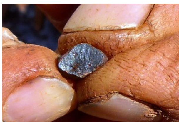
Figure 4 - concentrated haematite iron fragment in pisolite from Spearhole Channel Iron Deposit

The Spearhole detrital/channel iron deposit is over 1.6 kilometres wide with a maximum depth of approximately 35 metres and average depth of approximately 20 metres. The intersections show visual concentrations of iron in pisolitic material within several metres of Detrital and Channel Iron deposits. Some of the pisolites show high concentrations of haematite, see example Figure 4 .